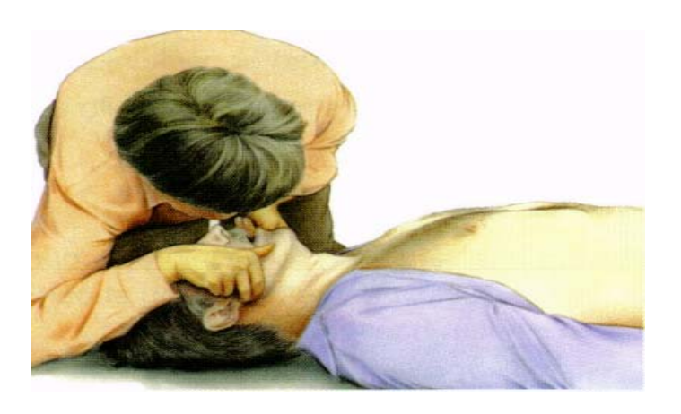
Figure 10. Open the airway with a jaw thrust. The jaw thrust opens the airway without moving the head and neck. Place your fingers on the angles of the jaw, and lift the jaw to move the jaw forward. This moves the tongue away from the back of the throat and opens the airway.